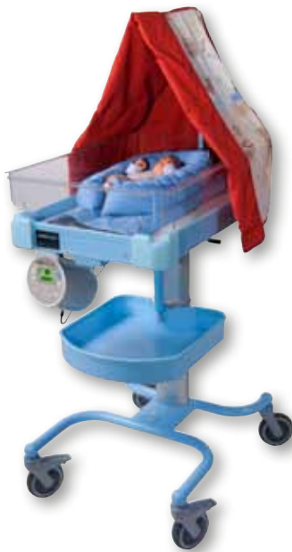
BB-3, KANMED BABYBED FIXED HEIGHT

Electrical height adjustment, mattress, tent (model BB-21/3) with tent pole, shelf, power cable, 19 cm high foldable side walls (24 cm height is also available).