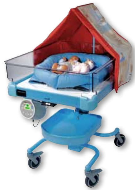
BB-4, KANMED BABYBED TWINS

Mattress, tent (model BB-21/3) with tent pole, shelf, 19 cm high foldable side walls (24 cm height is also available).