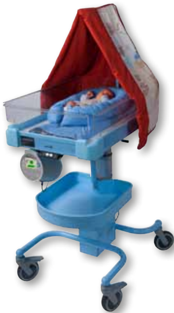
BB-1, KANMED BABYBED

(The BabyBeds shown below are equipped with the KANMED BABYWARMER which is ordered separately)