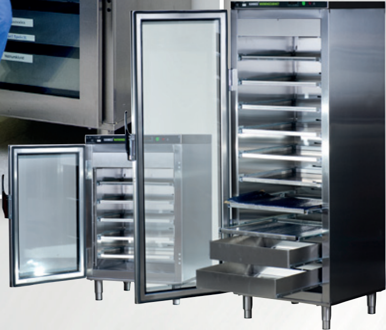
Universal Warming Cabinet Small Art. No. GE-2350S (Max 5 shelves or baskets)

The KANMED UNIVERSAL WARMING CABINET is designed to assist in the reduction of patient hypothermia and to increase the patient comfort. The Cabinets are mainly used in the operating theatre areas for warming intravenous fluids, dialysis & irrigation fluids, Kanmed Gel Pads and other gel positioning equipment.