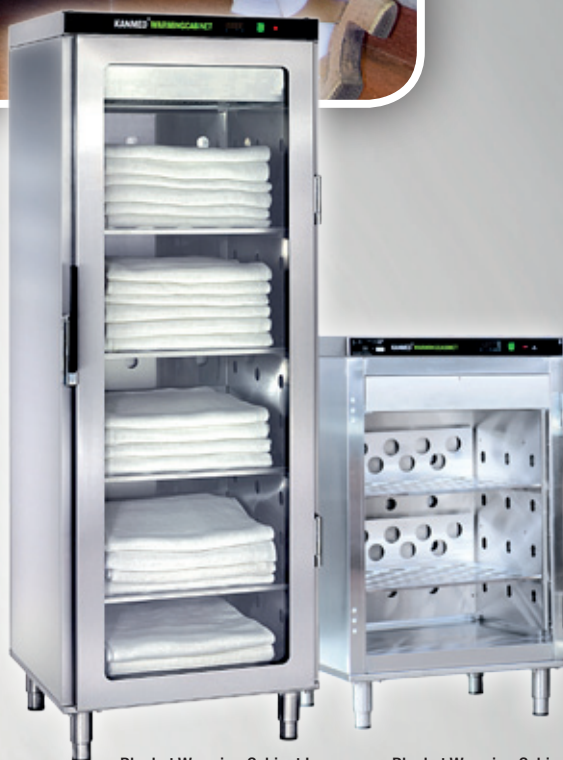
Blanket Warming Cabinet Large Art. No. GE-2380L (Max 5 shelves)

The KANMED BLANKET WARMING CABINET is used in the pre operation and recovery area to warm blankets and other patient bedding material. The Kanmed Warming Cabinets will actively assist in reducing hypothermia before and after surgery thereby avoiding uncomfortable shivering.